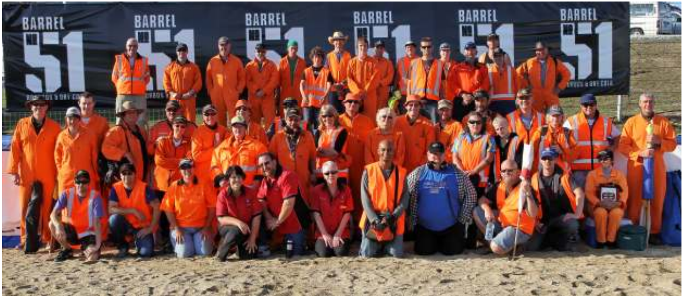
Round 5 NZ Superbike Nationals/NZTT - Hampton Downs 28 March 2010 Flagmarshalls and Officials