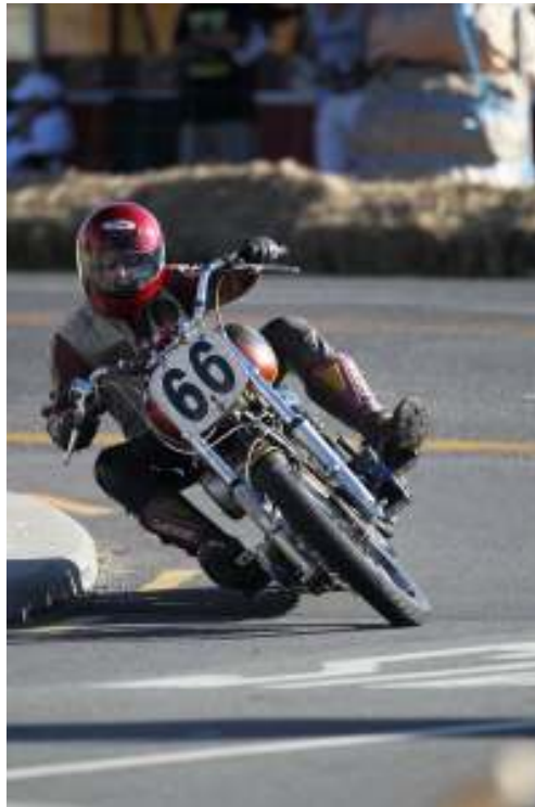
Battle of the Streets Paeroa 2010